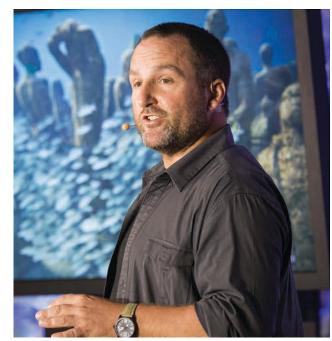
6 An underwater art museum, teeming with life