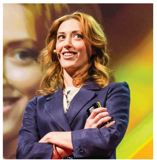
5 How to make stress your friend KELLY MCGONIGAL