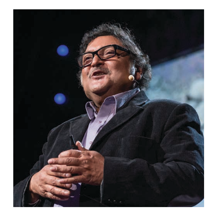
7 Build a school in the cloud SUGATA MITRA