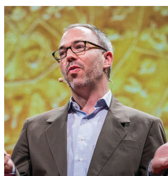
4 Big data is better data KENNETH CUKIER