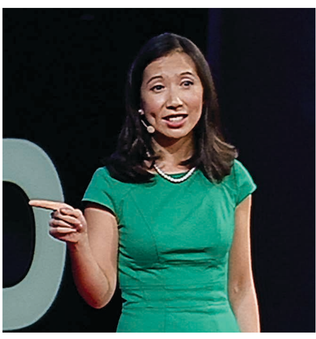
2 What your doctor won't disclose LEANA WEN