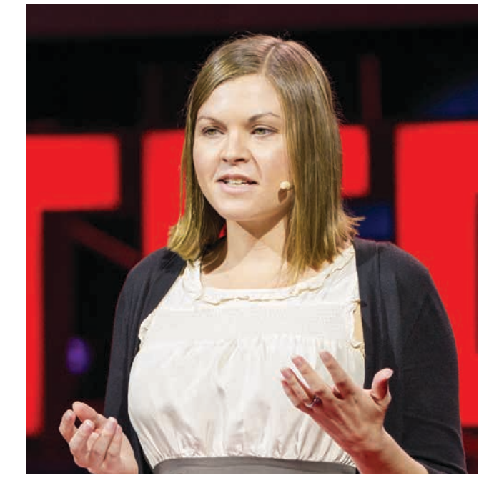
5 What fear can teach us KAREN THOMPSON WALKER