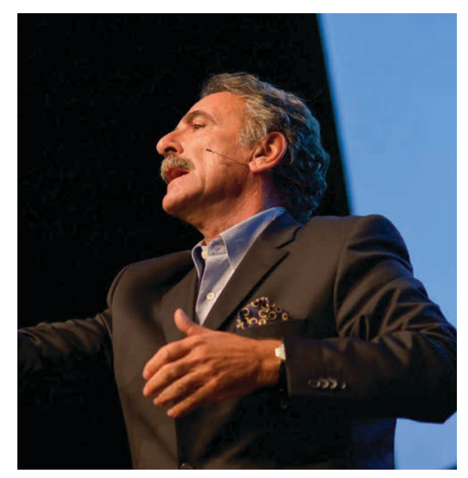
3 Want to help someone? Shut up and listen!