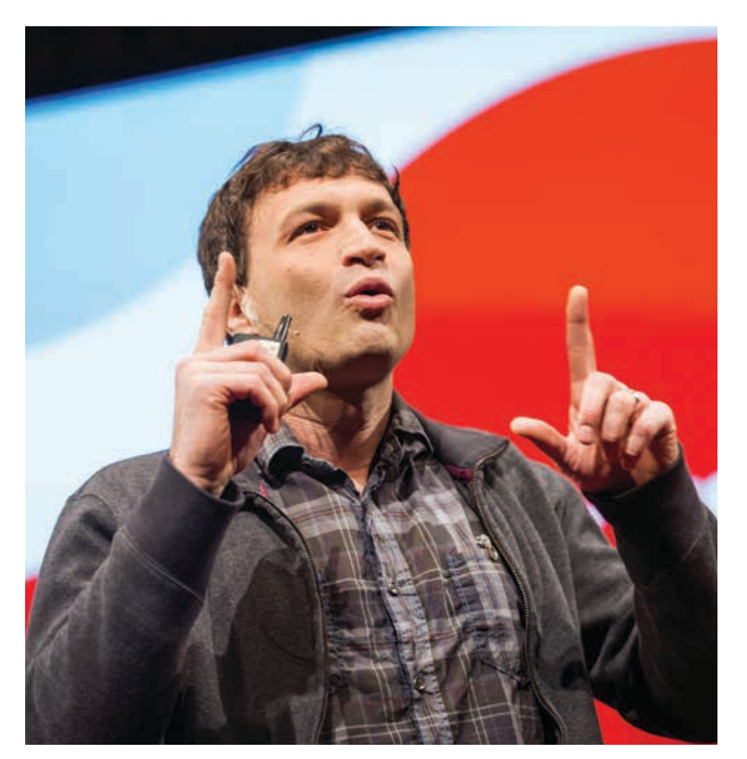
The hidden power of smiling RON GUTMAN